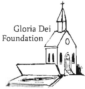
Gloria Dei Foundation

The Gloria Dei Foundation welcomes gifts of all sizes from members and friends of our congregation. It is intended that the gifts to the Foundation be "special" gifts, over and above regular contributions or capital